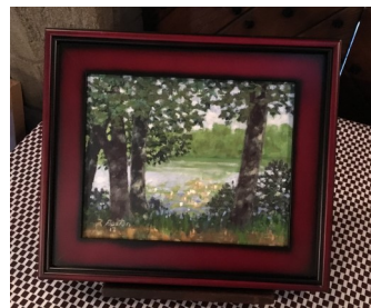
Great prizes were raffled off!